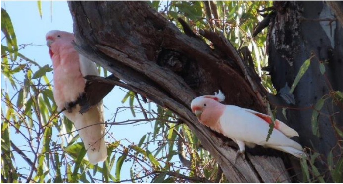
Photos: Pink cockatoos inspecting a River Red Gum hollow at Katarapko floodplain.